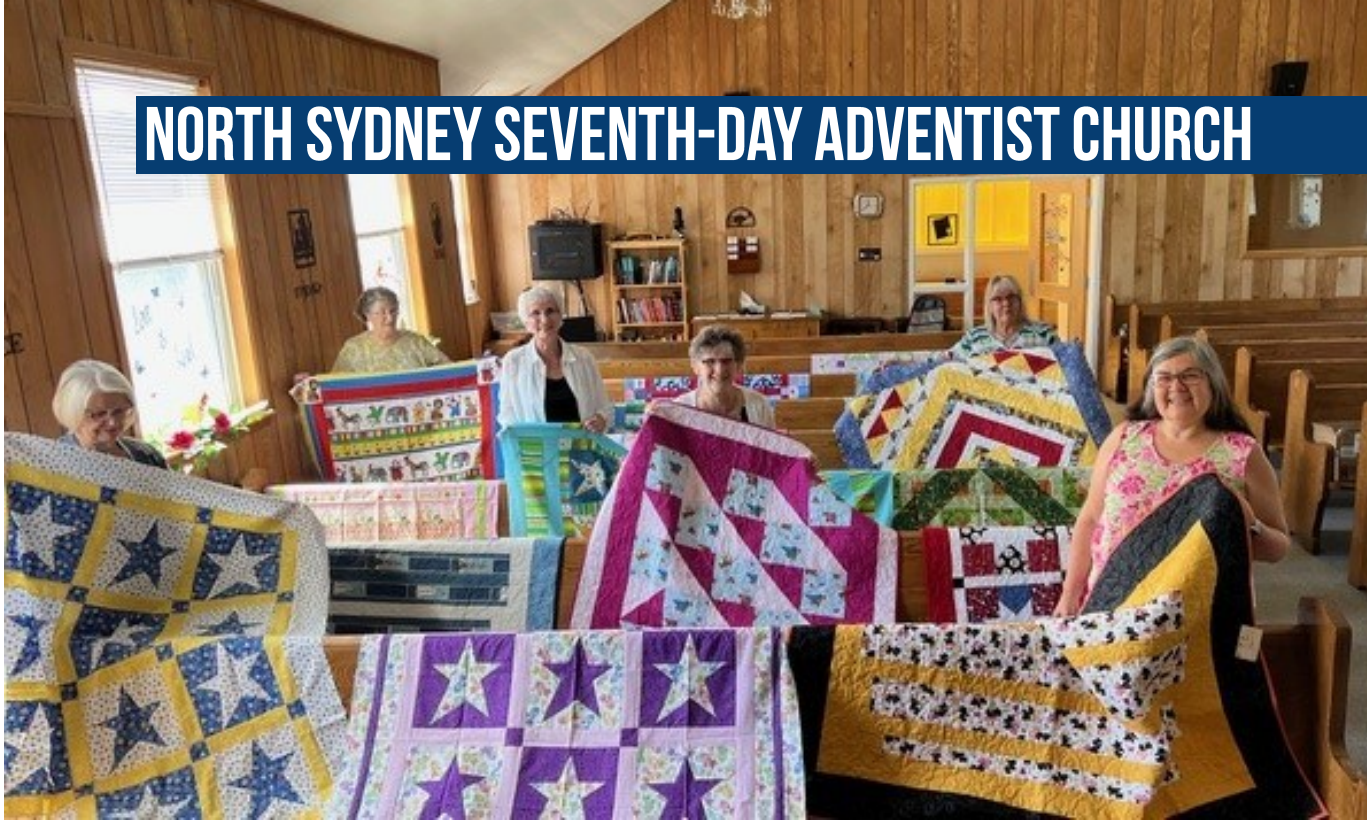
A sampling of the quilts that have been made by the ladies in the Bags Of Love program in the North Sydney SDA Church. Support for the project comes from as far as Ontario and the mainland of Nova Scotia. We have been greatly blessed.