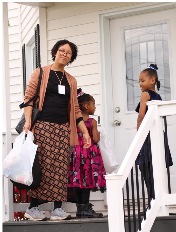
Members going to houses to collect donations from people in the community.

The approximate number of families benefiting from just one food drive is about 38. This means that about 152 people will be helped for at least 3-4 days. Those in need are welcome to use this service once a month without submitting any financial information, but if their family needs to come twice per month, then a financial statement is needed. The maximum number of visits a family can make is twice per month. We praise God for the powerful impact this organization has been making within the Moncton area.