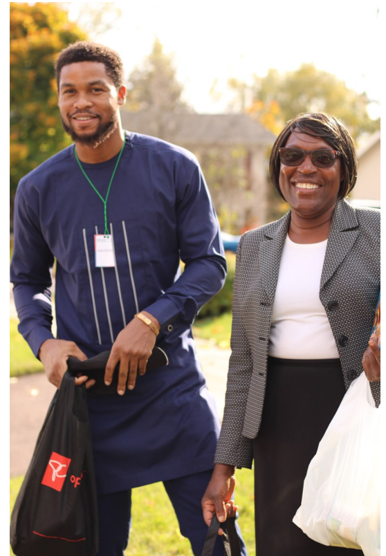
More members helping to collect donations from people in the community.

Executive Secretary of the Maritime Conference