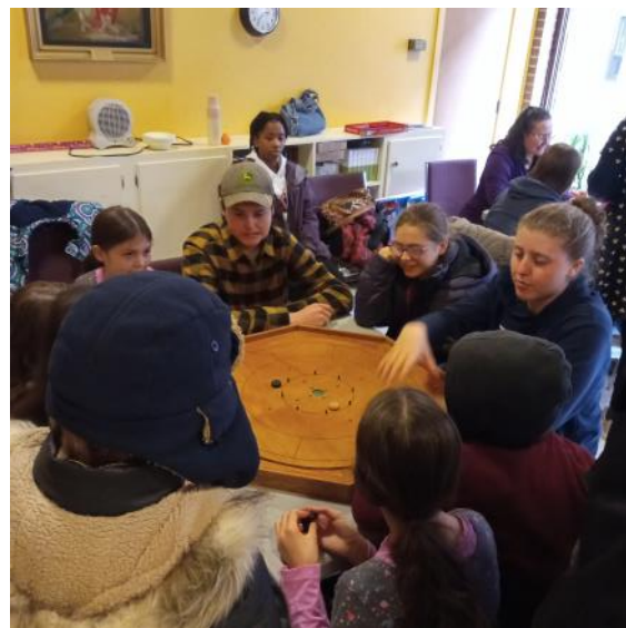
Our social gathering.